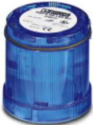
LED permanent light element, 24 V AC/DC, blue

Please be informed that the data shown in this PDF Document is generated from our Online Catalog. Please find the complete data in the user's documentation. Our General Terms of Use for Downloads are valid ( http://phoenixcontact.com/download )