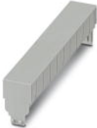
Component housing, Cover, Color: light gray, Width: 18.9 mm, Length: 109.8 mm, Height: 12.2 mm

Please be informed that the data shown in this PDF Document is generated from our Online Catalog. Please find the complete data in the user's documentation. Our General Terms of Use for Downloads are valid ( http://phoenixcontact.com/download )