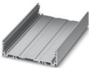
Press-drawn section housings, Basic profile, height: 105 mm

Please be informed that the data shown in this PDF Document is generated from our Online Catalog. Please find the complete data in the user's documentation. Our General Terms of Use for Downloads are valid ( http://phoenixcontact.com/download )