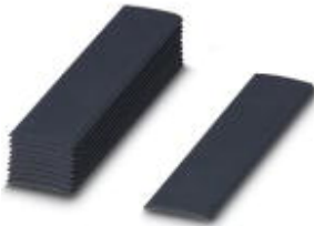
Decorative strip for HC-ALU panel mounting base

Please be informed that the data shown in this PDF Document is generated from our Online Catalog. Please find the complete data in the user's documentation. Our General Terms of Use for Downloads are valid ( http://phoenixcontact.com/download )