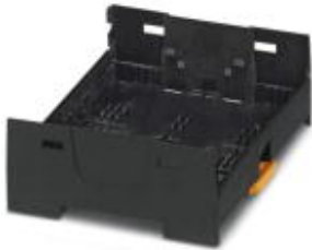
DIN rail housing, Lower housing part with base latch, flat design, width: 90.1 mm, color: black (9005)

Please be informed that the data shown in this PDF Document is generated from our Online Catalog. Please find the complete data in the user's documentation. Our General Terms of Use for Downloads are valid ( http://phoenixcontact.com/download )