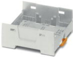
DIN rail housing, Lower housing part with base latch, flat design, width: 67.6 mm, color: light gray (7035)

Please be informed that the data shown in this PDF Document is generated from our Online Catalog. Please find the complete data in the user's documentation. Our General Terms of Use for Downloads are valid ( http://phoenixcontact.com/download )