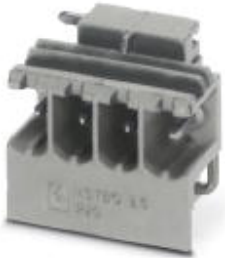
PCB headers, number of positions: 4, pitch: 5 mm, color: light gray, Article with lateral pin exit

Please be informed that the data shown in this PDF Document is generated from our Online Catalog. Please find the complete data in the user's documentation. Our General Terms of Use for Downloads are valid ( http://phoenixcontact.com/download )