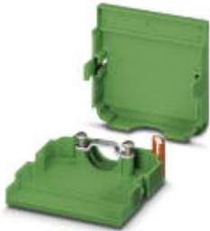
Cable housing, Pitch: 3.81 mm, Number of positions: 7, Dimension a: 29.09 mm, Color: green

Please be informed that the data shown in this PDF Document is generated from our Online Catalog. Please find the complete data in the user's documentation. Our General Terms of Use for Downloads are valid ( http://phoenixcontact.com/download )