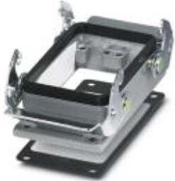
HEAVYCON panel mounting base B50, with double locking latch, height 28 mm

Please be informed that the data shown in this PDF Document is generated from our Online Catalog. Please find the complete data in the user's documentation. Our General Terms of Use for Downloads are valid ( http://phoenixcontact.com/download )