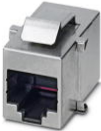
RJ45 socket insert, modular (Keystone), CAT5e, 8-pos., shielded, socket on socket

Please be informed that the data shown in this PDF Document is generated from our Online Catalog. Please find the complete data in the user's documentation. Our General Terms of Use for Downloads are valid ( http://phoenixcontact.com/download )