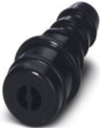
Pneumatic pin, for HC-M-PN2 module, internal hose diameter of 6.0 mm

Please be informed that the data shown in this PDF Document is generated from our Online Catalog. Please find the complete data in the user's documentation. Our General Terms of Use for Downloads are valid ( http://phoenixcontact.com/download )