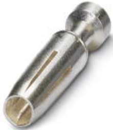
Turned 2.5 crimp contact, individual female contact, core diameter 2.5 mm 2 , silver-plated

Please be informed that the data shown in this PDF Document is generated from our Online Catalog. Please find the complete data in the user's documentation. Our General Terms of Use for Downloads are valid ( http://phoenixcontact.com/download )