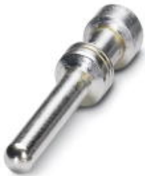
Turned 2.5 crimp contact, individual male contact, core diameter 2.5 mm 2 , silver-plated

Please be informed that the data shown in this PDF Document is generated from our Online Catalog. Please find the complete data in the user's documentation. Our General Terms of Use for Downloads are valid ( http://phoenixcontact.com/download )