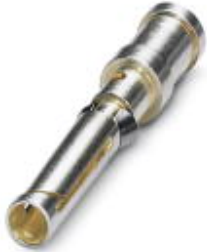
Turned 1.6 crimp contact, individual female contact, core diameter 0.5 mm 2 , silver-plated

Please be informed that the data shown in this PDF Document is generated from our Online Catalog. Please find the complete data in the user's documentation. Our General Terms of Use for Downloads are valid ( http://phoenixcontact.com/download )