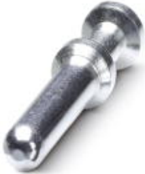
Turned 4.0 crimp contact, individual male contact, core diameter 6.00 mm 2 , silver-plated

Please be informed that the data shown in this PDF Document is generated from our Online Catalog. Please find the complete data in the user's documentation. Our General Terms of Use for Downloads are valid ( http://phoenixcontact.com/download )