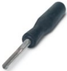
Contact removal tool, for rotated CK-4,0-... contacts

Please be informed that the data shown in this PDF Document is generated from our Online Catalog. Please find the complete data in the user's documentation. Our General Terms of Use for Downloads are valid ( http://phoenixcontact.com/download )