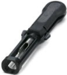
Contact removal tool, for turned CK 2,5... contacts

Please be informed that the data shown in this PDF Document is generated from our Online Catalog. Please find the complete data in the user's documentation. Our General Terms of Use for Downloads are valid ( http://phoenixcontact.com/download )