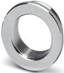
Reducing adapter, metal, M32 to M25, including O-ring

Please be informed that the data shown in this PDF Document is generated from our Online Catalog. Please find the complete data in the user's documentation. Our General Terms of Use for Downloads are valid ( http://phoenixcontact.com/download )