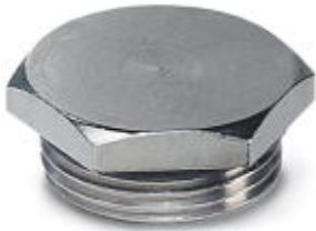
Filler plug, metal, size: M20

Please be informed that the data shown in this PDF Document is generated from our Online Catalog. Please find the complete data in the user's documentation. Our General Terms of Use for Downloads are valid ( http://phoenixcontact.com/download )