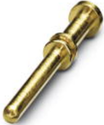
Crimp contact, turned, contact diameter: 2 mm, crimp range: 0.75 mm 2 ... 1.5 mm 2

Please be informed that the data shown in this PDF Document is generated from our Online Catalog. Please find the complete data in the user's documentation. Our General Terms of Use for Downloads are valid ( http://phoenixcontact.com/download )