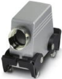
HEAVYCON sleeve housing B24, with double locking latch, height 76 mm, with support 1x M25, lateral conductor exit

Please be informed that the data shown in this PDF Document is generated from our Online Catalog. Please find the complete data in the user's documentation. Our General Terms of Use for Downloads are valid ( http://phoenixcontact.com/download )