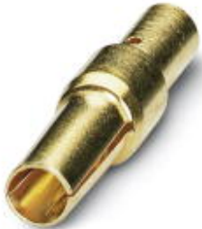
Crimp contact, turned, Single contact, contact diameter: 1 mm, crimp range: 0.14 mm 2 ... 0.56 mm 2

Please be informed that the data shown in this PDF Document is generated from our Online Catalog. Please find the complete data in the user's documentation. Our General Terms of Use for Downloads are valid ( http://phoenixcontact.com/download )