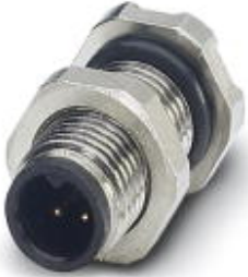
Sensor/actuator flush-type plug, 3-pos., M5, prewall/screw mounting, with straight solder connection

Please be informed that the data shown in this PDF Document is generated from our Online Catalog. Please find the complete data in the user's documentation. Our General Terms of Use for Downloads are valid ( http://phoenixcontact.com/download )