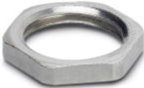
Flat nut with M16 thread

Please be informed that the data shown in this PDF Document is generated from our Online Catalog. Please find the complete data in the user's documentation. Our General Terms of Use for Downloads are valid ( http://phoenixcontact.com/download )