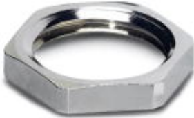
Flat nut with Pg9 thread

Please be informed that the data shown in this PDF Document is generated from our Online Catalog. Please find the complete data in the user's documentation. Our General Terms of Use for Downloads are valid ( http://phoenixcontact.com/download )