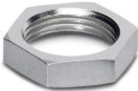
Flat nut with M8 thread

Please be informed that the data shown in this PDF Document is generated from our Online Catalog. Please find the complete data in the user's documentation. Our General Terms of Use for Downloads are valid ( http://phoenixcontact.com/download )