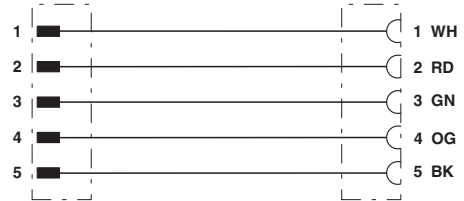
Contact assignment of 7/8" plug