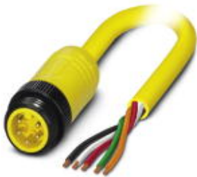
Power cable, 5-position, PVC, yellow, Plug straight 7/8"-16UNF, on free cable end, Cable length: 5 m

Please be informed that the data shown in this PDF Document is generated from our Online Catalog. Please find the complete data in the user's documentation. Our General Terms of Use for Downloads are valid ( http://phoenixcontact.com/download )