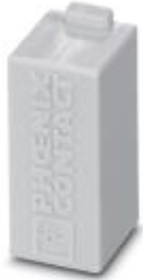
HEAVYCON dummy module, for unused slots in the module carrier frame

Please be informed that the data shown in this PDF Document is generated from our Online Catalog. Please find the complete data in the user's documentation. Our General Terms of Use for Downloads are valid ( http://phoenixcontact.com/download )