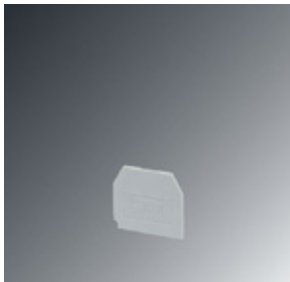
End cover, Length: 35 mm, Width: 1.5 mm, Color: gray

Please be informed that the data shown in this PDF Document is generated from our Online Catalog. Please find the complete data in the user's documentation. Our General Terms of Use for Downloads are valid ( http://download.phoenixcontact.com )