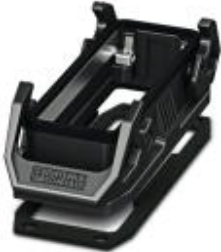
HEAVYCON EVO panel mounting base, plastic, B24, with double locking latch, height: 30.5 mm, with flat gasket

Please be informed that the data shown in this PDF Document is generated from our Online Catalog. Please find the complete data in the user's documentation. Our General Terms of Use for Downloads are valid ( http://phoenixcontact.com/download )