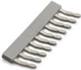
Insertion bridge, Number of positions: 10, Color: gray

Please be informed that the data shown in this PDF Document is generated from our Online Catalog. Please find the complete data in the user's documentation. Our General Terms of Use for Downloads are valid ( http://phoenixcontact.com/download )