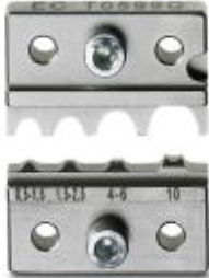
Die for crimping machine CF 500, for cable lugs (C-RC... and C-FC...) 0.5 ... 10 mm 2

Please be informed that the data shown in this PDF Document is generated from our Online Catalog. Please find the complete data in the user's documentation. Our General Terms of Use for Downloads are valid ( http://phoenixcontact.com/download )