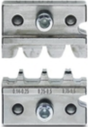
Die for crimping machine CF 500, for slip-on sleeves and flat connectors (C-SCF... and C-SCM...) 0.1 ... 1.5 mm 2

Please be informed that the data shown in this PDF Document is generated from our Online Catalog. Please find the complete data in the user's documentation. Our General Terms of Use for Downloads are valid ( http://phoenixcontact.com/download )