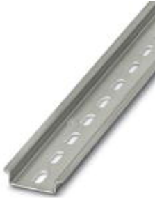
NS 35 DIN rail, according to customer specifications, perforated, height: 7,5 mm, width: 35 mm

Please be informed that the data shown in this PDF Document is generated from our Online Catalog. Please find the complete data in the user's documentation. Our General Terms of Use for Downloads are valid ( http://phoenixcontact.com/download )