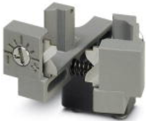
Adjustable spare stripping knife, 0.75 mm 2 , for crimping machine CF 3000

Please be informed that the data shown in this PDF Document is generated from our Online Catalog. Please find the complete data in the user's documentation. Our General Terms of Use for Downloads are valid ( http://phoenixcontact.com/download )