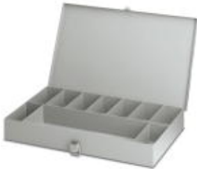
Assortment box, metal, no components mounted

Please be informed that the data shown in this PDF Document is generated from our Online Catalog. Please find the complete data in the user's documentation. Our General Terms of Use for Downloads are valid ( http://phoenixcontact.com/download )