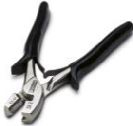
Crimping pliers, for ferrules in accordance with DIN 46228-1: 1992-08 and DIN 46228-4: 1990-09

Please be informed that the data shown in this PDF Document is generated from our Online Catalog. Please find the complete data in the user's documentation. Our General Terms of Use for Downloads are valid ( http://phoenixcontact.com/download )