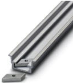
Slide nut, for DIN rail NS 35/15-AL, with M5 thread, for mounting equipment, material: Steel

Please be informed that the data shown in this PDF Document is generated from our Online Catalog. Please find the complete data in the user's documentation. Our General Terms of Use for Downloads are valid ( http://phoenixcontact.com/download )