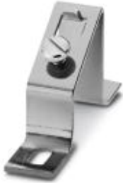
Angled brackets with M6 screw, DIN rail limit stop, for fixing DIN rails at an angle of 30°, height: 46 mm

Please be informed that the data shown in this PDF Document is generated from our Online Catalog. Please find the complete data in the user's documentation. Our General Terms of Use for Downloads are valid ( http://phoenixcontact.com/download )