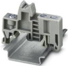
End clamp, Width: 9.5 mm, Height: 35.3 mm, Length: 50.5 mm, Color: gray

Please be informed that the data shown in this PDF Document is generated from our Online Catalog. Please find the complete data in the user's documentation. Our General Terms of Use for Downloads are valid ( http://phoenixcontact.com/download )