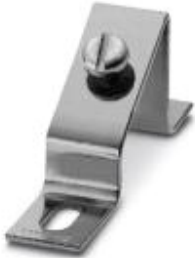
Angled brackets with M 6 screw, for fixing DIN rails at an angle of 30°, height: 35.4 mm

Please be informed that the data shown in this PDF Document is generated from our Online Catalog. Please find the complete data in the user's documentation. Our General Terms of Use for Downloads are valid ( http://phoenixcontact.com/download )