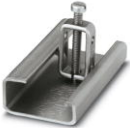
End clamp, width: 8 mm

Please be informed that the data shown in this PDF Document is generated from our Online Catalog. Please find the complete data in the user's documentation. Our General Terms of Use for Downloads are valid ( http://phoenixcontact.com/download )