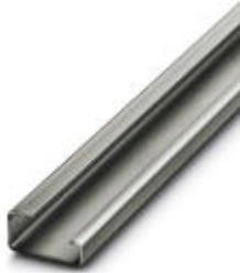
G-profile DIN rail, material: Steel, unperforated, height 15 mm, width 32 mm, length 2 m

Please be informed that the data shown in this PDF Document is generated from our Online Catalog. Please find the complete data in the user's documentation. Our General Terms of Use for Downloads are valid ( http://phoenixcontact.com/download )