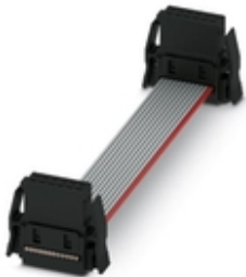
Assembled IDC female connector, rated current: 1.2 A, Cable 1: cable length: 0.1 m, Color: gray, Cable type: Flat-ribbon conductor, Flat-ribbon conductor

Please be informed that the data shown in this PDF Document is generated from our Online Catalog. Please find the complete data in the user's documentation. Our General Terms of Use for Downloads are valid ( http://phoenixcontact.com/download )