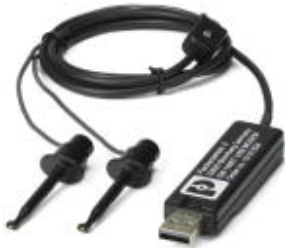
USB HART modem cable for communication between a PC and HART devices, cable length: 1m.

Please be informed that the data shown in this PDF Document is generated from our Online Catalog. Please find the complete data in the user's documentation. Our General Terms of Use for Downloads are valid ( http://phoenixcontact.com/download )