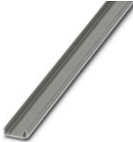
Marker carriers, transparent, unlabeled, mounting type: adhesive, lettering field size: 1000 x 15 mm

Please be informed that the data shown in this PDF Document is generated from our Online Catalog. Please find the complete data in the user's documentation. Our General Terms of Use for Downloads are valid ( http://phoenixcontact.com/download )