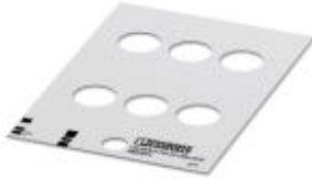
The figure shows version

Plastic label, with bore hole, Card, white, unlabeled, can be labeled with: THERMOMARK PRIME, THERMOMARK CARD, Mounting type: Adhesive, Lettering field: 1 of 30 x 18 mm and 1 of 30 x 8 mm