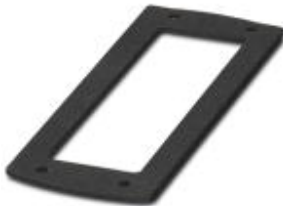
The photo shows size B16