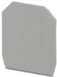
End cover, Length: 52 mm, Width: 2 mm, Color: gray

Please be informed that the data shown in this PDF Document is generated from our Online Catalog. Please find the complete data in the user's documentation. Our General Terms of Use for Downloads are valid ( http://phoenixcontact.com/download )