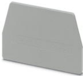
End cover, Length: 61 mm, Width: 2.2 mm, Color: gray

Please be informed that the data shown in this PDF Document is generated from our Online Catalog. Please find the complete data in the user's documentation. Our General Terms of Use for Downloads are valid ( http://phoenixcontact.com/download )